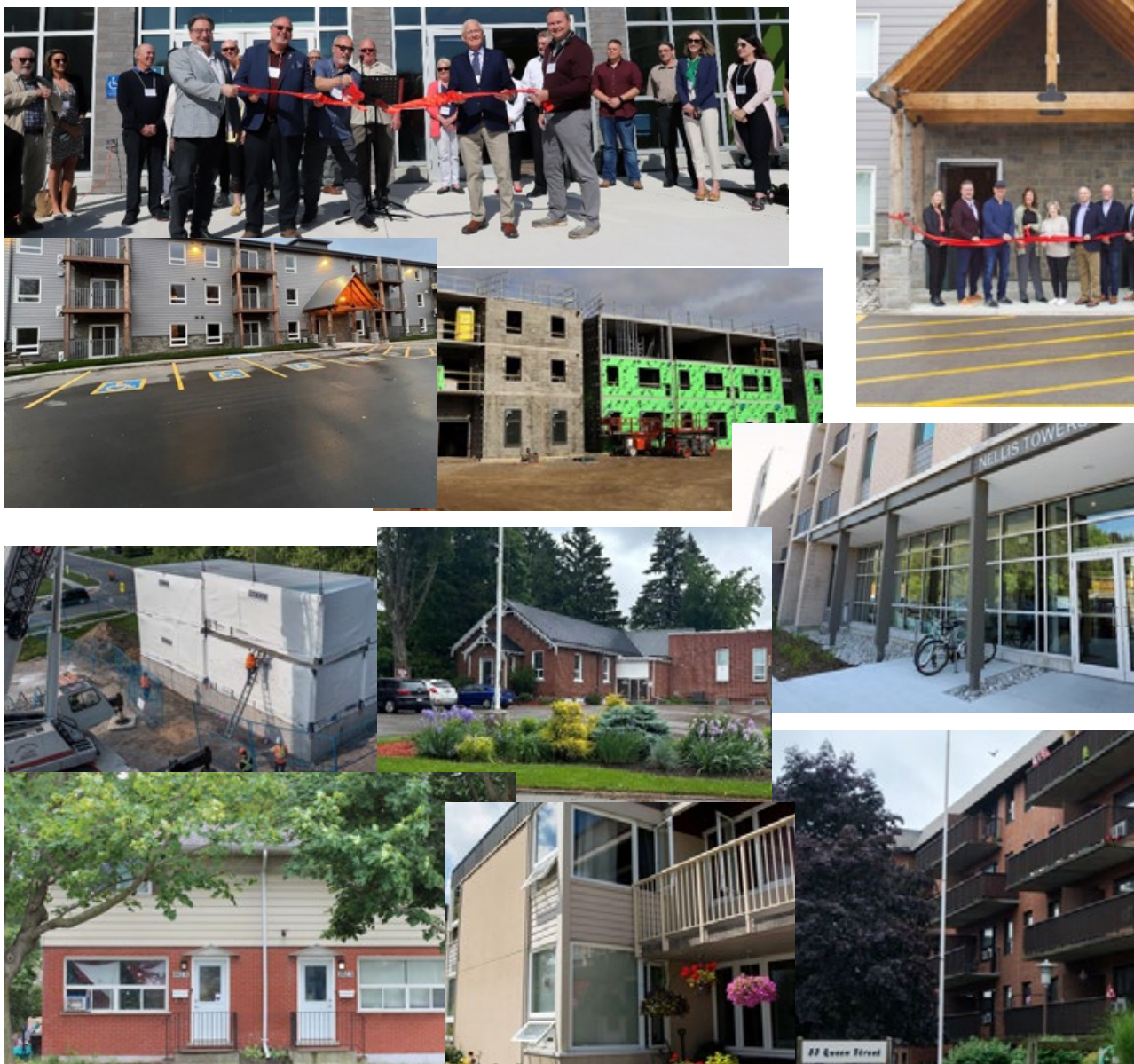
Clockwise, starting from left: Nellis Towers ribbon cutting (Woodstock); Ingrid's Place ribbon cutting (Plattsville); Nellis Towers; Tillsonburg Non-Profit Housing; 82 Finkle Street (Woodstock); 738 Parkinson Road under construction (Woodstock); Ingrid's Place. Centre, upper and lower: The Inn (Woodstock); Nellis Towers under construction (Woodstock).

We look forward to continuing to work with other levels of government, the private sector and our community partners to achieve our vision of "Housing for All."