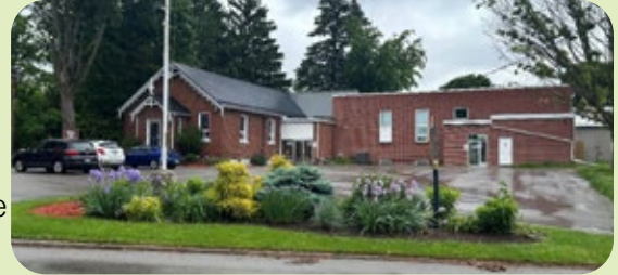
The Inn, Emergency Shelter, Woodstock

The County and community partners provide a broad range of services to individuals whose housing is at risk, with a goal of preventing homelessness. Some of these services include mental health and addictions programs, financial assistance, food banks, system navigation, and life stabilization case management.