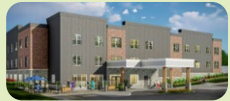
peopleCare Tavistock, Long-Term Care Home

Supportive housing provides both affordable housing and support services for individuals with unique needs. Supportive housing programs are both a County and provincial responsibility.