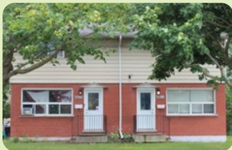
802 Alice, County-Owned Housing, Woodstock

Key elements of the housing system include the following.