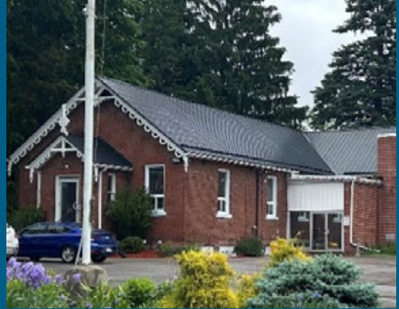
The Inn, Emergency Shelter, Woodstock

More than 25 new beds were added to the County's emergency overnight shelter in 2023, through an initiative between Operation Sharing (The Inn), Old St Paul's Anglican Church and the County. The expanded space at 723 Dundas Street, Woodstock, is now able to accommodate up to 55 individuals for emergency overnight beds in the community, along with meal, clothing, shower and washroom access overnight. This joint initiative provides a safe and supportive environment for individuals who are experiencing homelessness, with a goal of reducing the number of individuals who need to access emergency shelter.